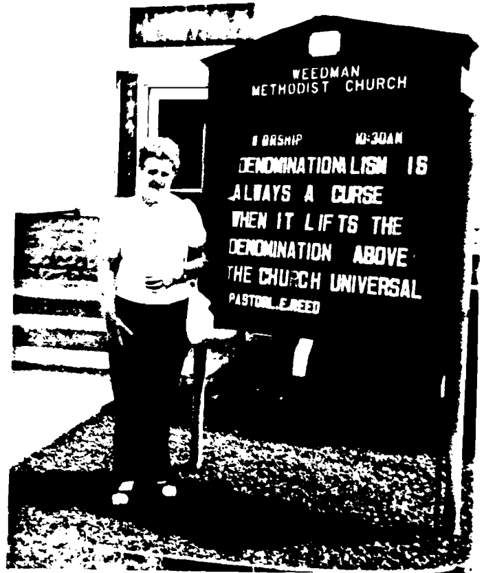
GENEVA at Weedman Church, Weedman, IL