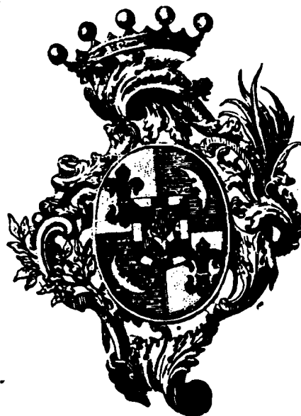
Frieherren von Widmann Arms